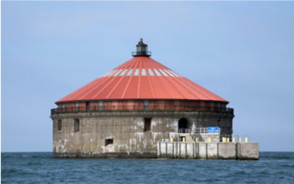
BUFFALO INTAKE CRIB