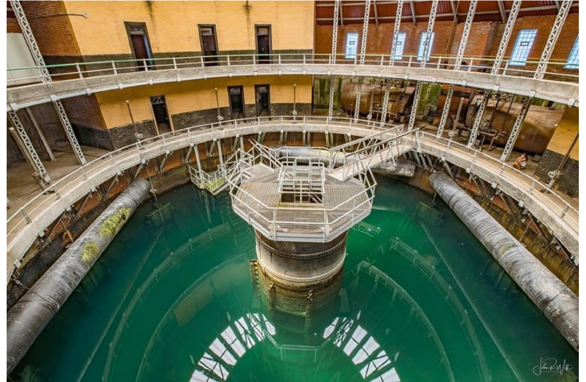
BUFFALO INTAKE CRIB

Buffalo Water Intake Building/Crib See more here