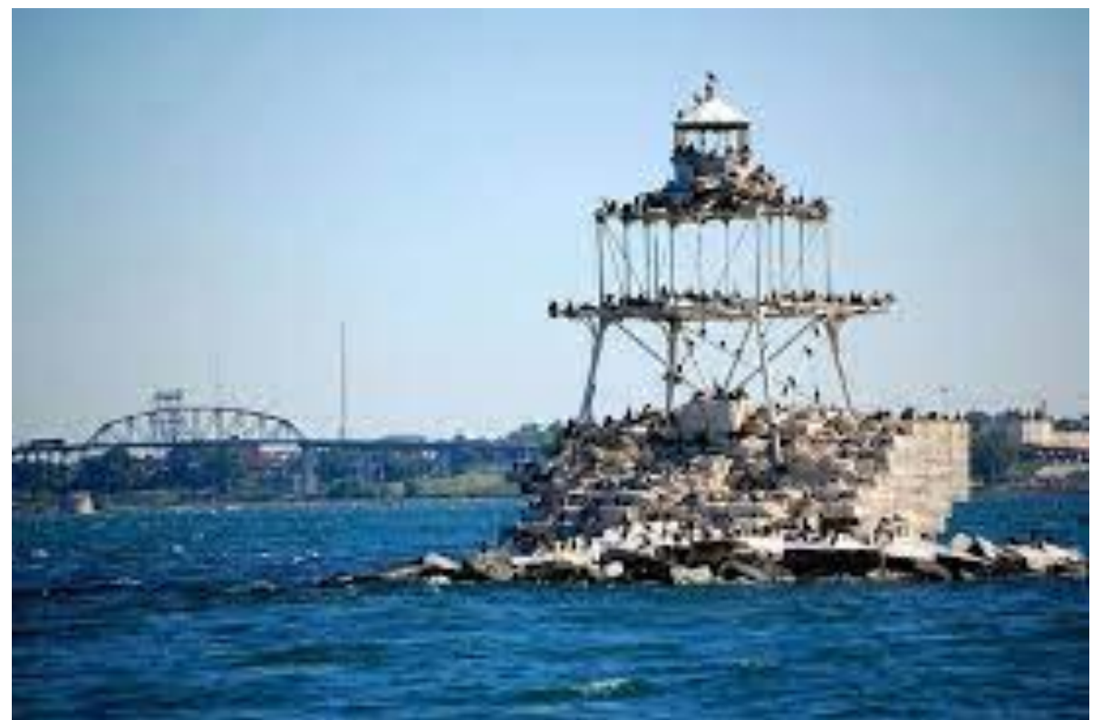
HORSESHOE REEF LIGHTHOUSE

Horseshoe Reef Lighthouse Learn more here