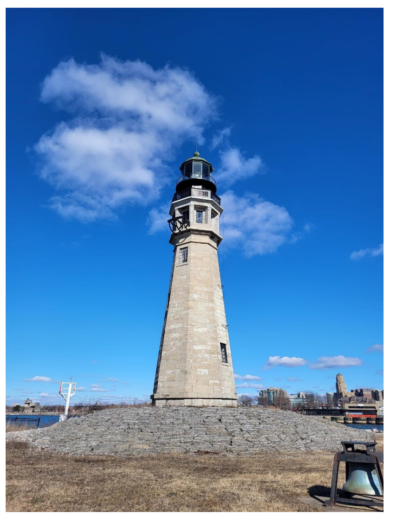
BUFFALO LIGHTHOUSE FEBRUARY 14TH